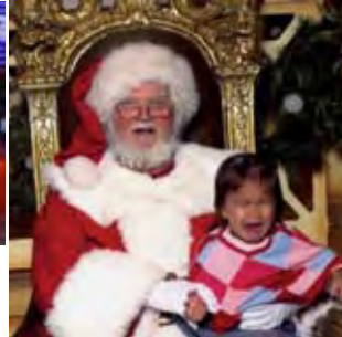
... 'you-know-who' showed up without my new sailboat!! Boo-hoo-hoo!!

CAN YOU BELIEVE we are back to cold weather, rain, snow, ice, etc.?? I know we are tough, but I think people who migrate to Florida in the winter months have something there.... MORE SAILING!!